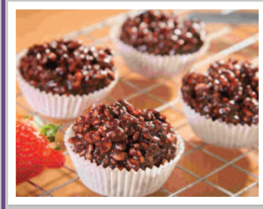
Chocolate Crispy Cake