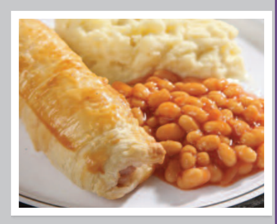
Homemade Sausage Roll served with Mashed Potato & Baked Beans