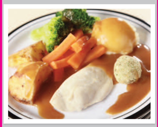
Roast Chicken served with Roast/Mashed Potatoes, Seasonal Vegetables & Gravy