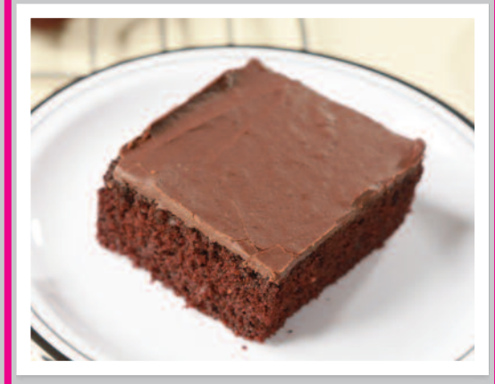
Wacky Chocolate Cake