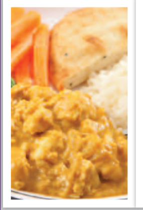
Chicken Korma served with Rice, Naan Bread & Seasonal Vegetables or Hot Pizza Baguette served with Carrot & Cucumber Sticks