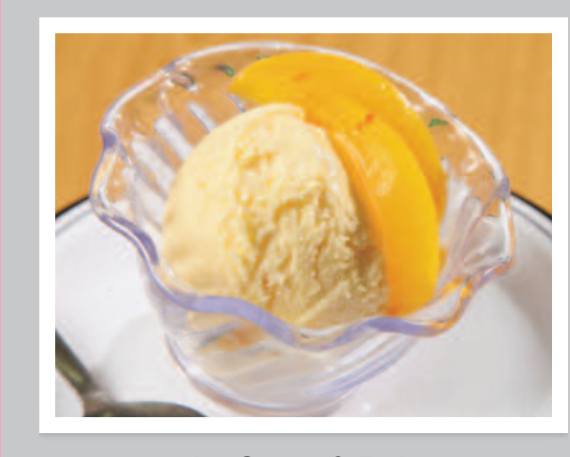
Ice Cream & Fruit