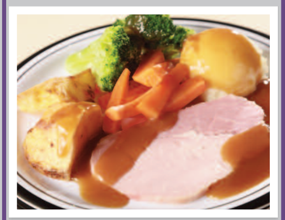
Honey Roast Gammon served with Roast/Mashed Potatoes, Seasonal Vegetables & Gravy