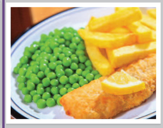
Battered Fish (MSC) served with Chips & Peas or Baked Beans