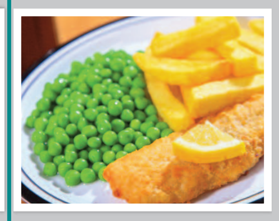
Battered Fish (MSC) served with Chips & Peas or Baked Beans