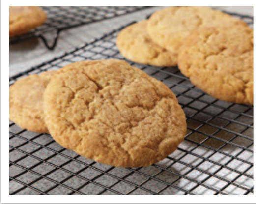
Snicker Doodle Biscuit

AVAILABLE DAILY - UNLIMITED SALAD, FRESHLY BAKED BREAD, FRUIT YOGHURT, FRESH FRUIT PLATTER & CHILLED WATER. FOR ALLERGEN INFORMATION, PLEASE ASK ONE OF OUR CATERING TEAM. ALL THE ABOVE DISHES ARE SUBJECT TO AVAILABILITY.