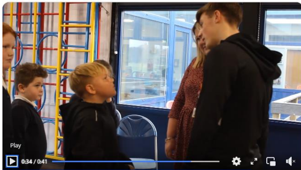
Tranmere Rovers in the Community 16 h · 🌐